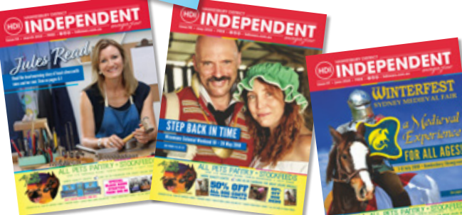
A copy of our advertising terms & conditions are available on our website www.hdinews.com.au